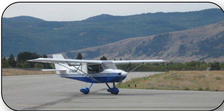
RANS Coyote II