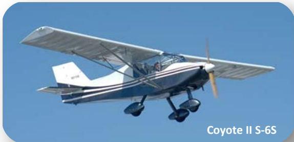
Coyote II S-6S