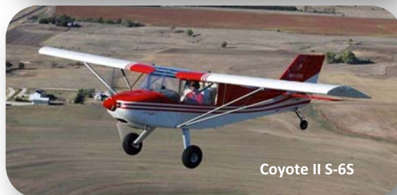
Coyote II S-6S